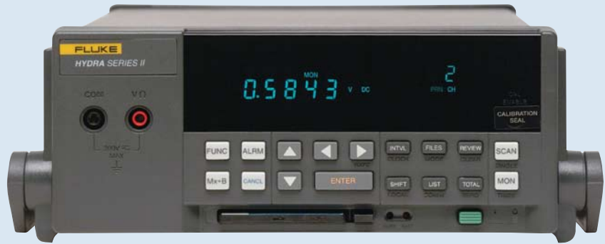
Hydra Data Bucket

Choose from three Fluke Hydra Series models, all featuring removable memory card data storage, internal memory storage, and direct real-time data transfer options. Should power fail, these instruments automatically resume data collection when power is restored.