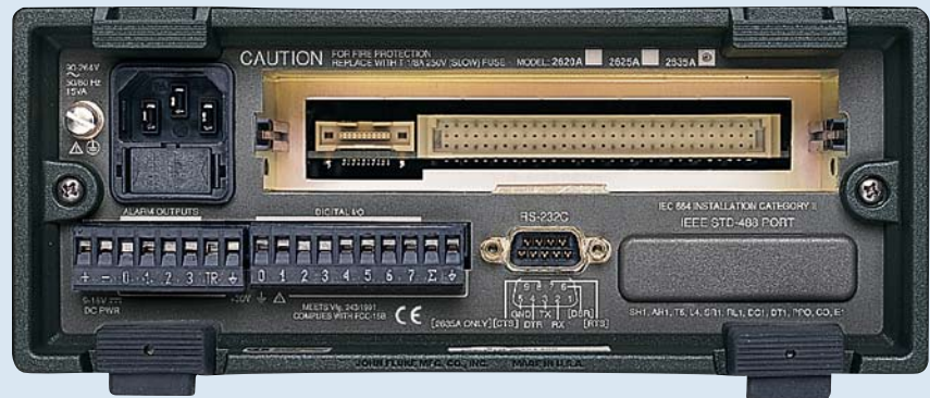
Hydra Series (Universal Input Module Removed)